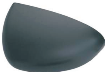
MIRROR COVER W/O LAMP