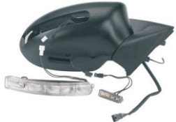
Photo 1: Position both the indicator lamp and puddle lamp in their respective sockets in the mirror housing

1. Colour match painted is highly recommended before installation of both indicator and puddle lamp into the mirror housing. This not only enables ease of painting but ensures protection of the lighting components.