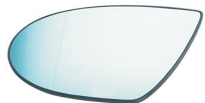
ASPHERICAL BLUE MIRROR GLASS